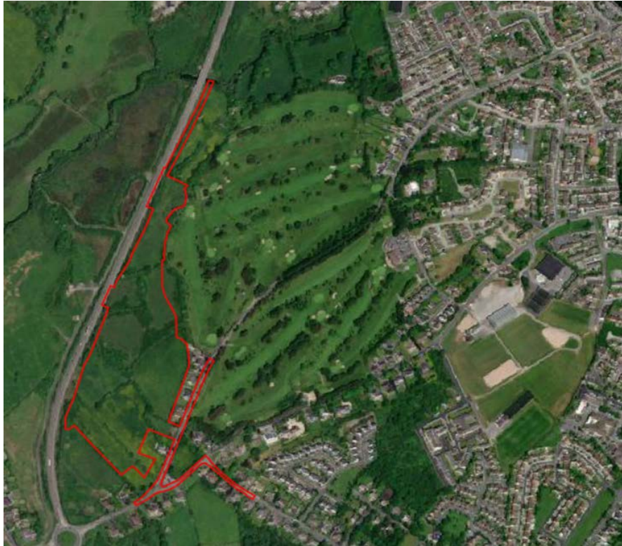
Figure 2-1: Proposed Site Location

The site location and proposed site development layout are shown in the following Figures.