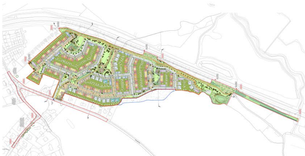
Figure 2-2: Proposed Site Development Layout